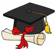
Residents from Chesterton Road House

The group of residents in picture went one Saturday to the Stourbridge Fair in Cambridge and watched the medieval re-enactment outside The Leper Chapel of Saint Mary Magdalene.